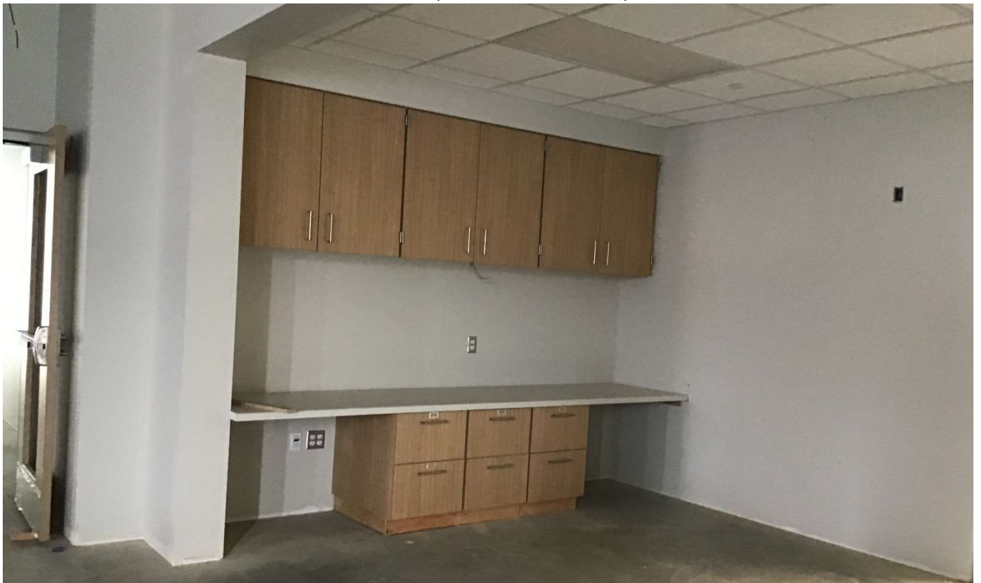
Cabinets in a Work Area on Level 2