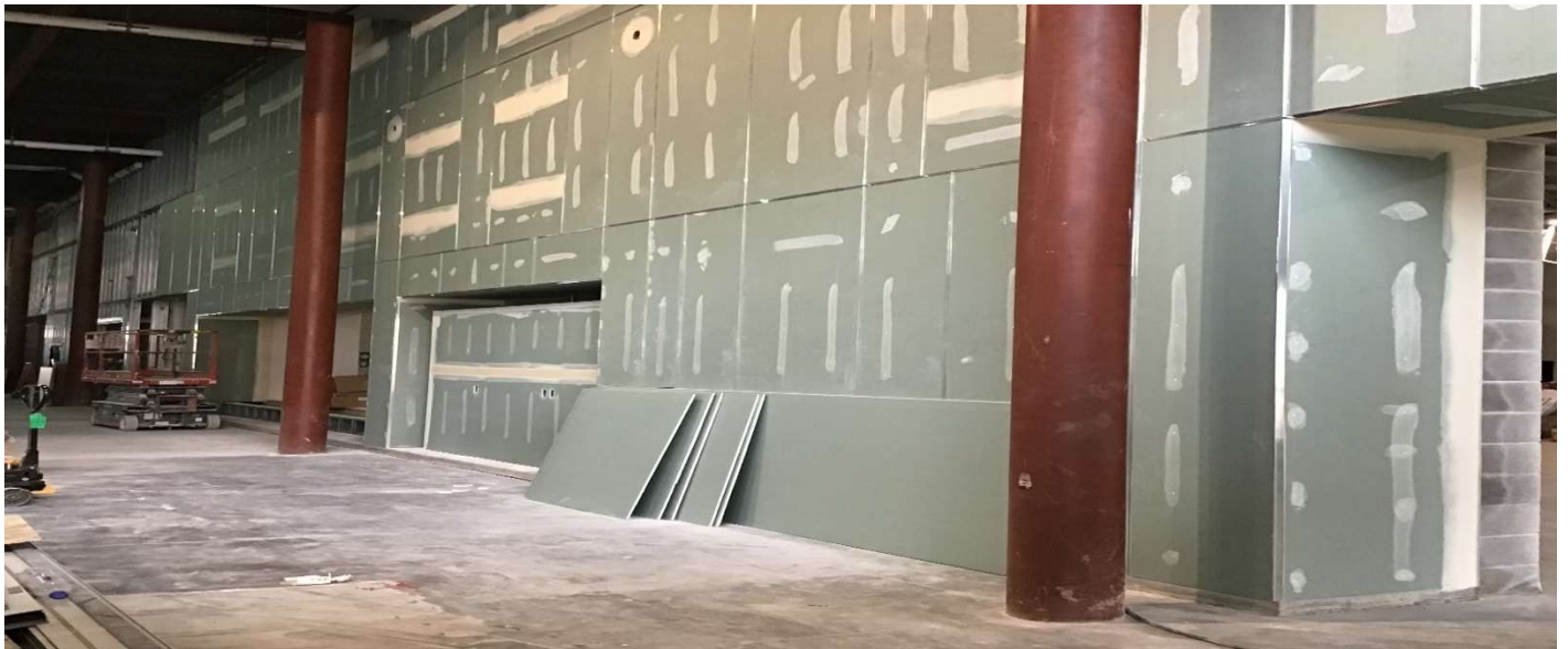
Drywall Progress in the Cafeteria